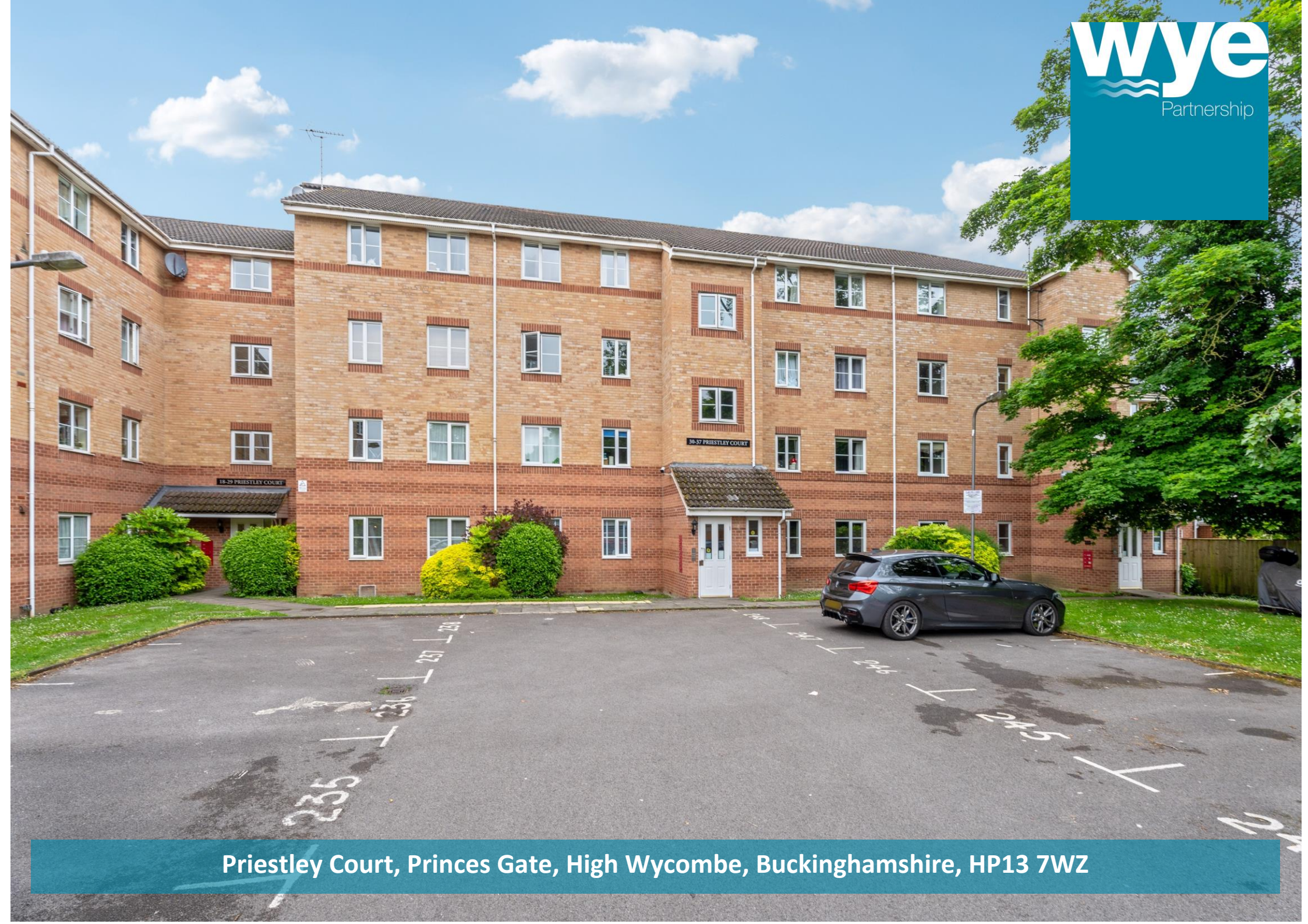
Priestley Court, Princes Gate, High Wycombe, Buckinghamshire, HP13 7WZ